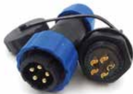
5-Pin IP67 Socket

The Zenosmart LCCB Controller is available with various connection options. Options include direct PCB soldering with IP67 glands 5 pin IP67 connector sets. For more information, please contact our sales or customer service team.