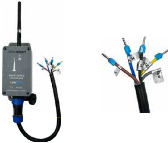
Custom Box Lighting Controller

The Zenosmart LCCB Controller is a state-of-the-art wireless remote control unit specifically designed for road and street lighting, park and garden lighting, as well as indoor and outdoor lighting in buildings. Its compact housing allows for easy installation on any luminaire or pole, offering maximum installation flexibility.